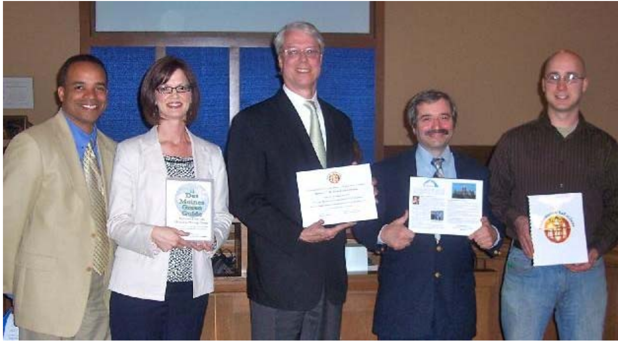
Mayor Franklin Cownie of Des Moines Receives Des Moines Environmental Hall of Fame Award

Please See Community Photo Gallery at EnvironmentalHallofFame.net