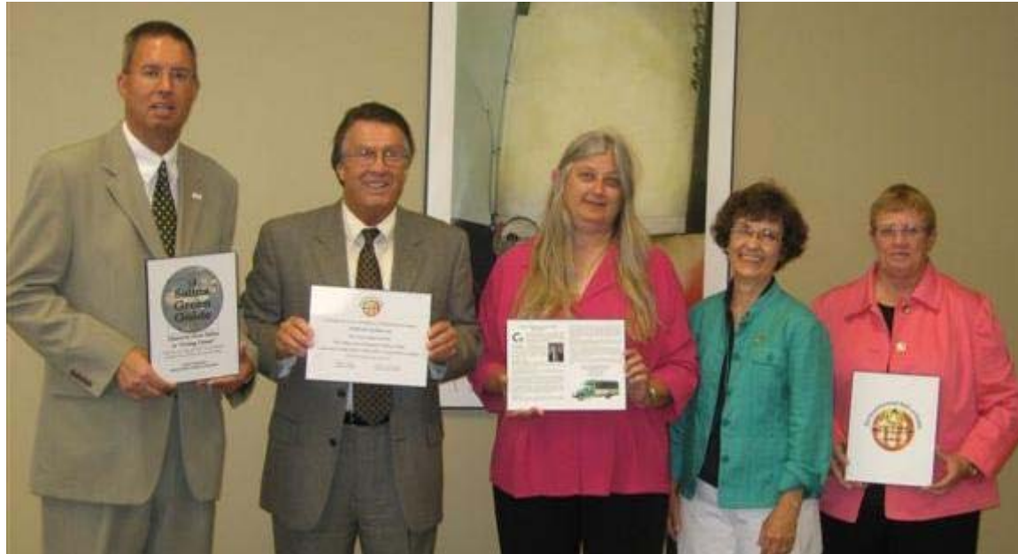
Salinas, Kansas Chamber of Commerce Presents Environmental Hall of Fame Award

Please See Community Photo Gallery at EnvironmentalHallofFame.net